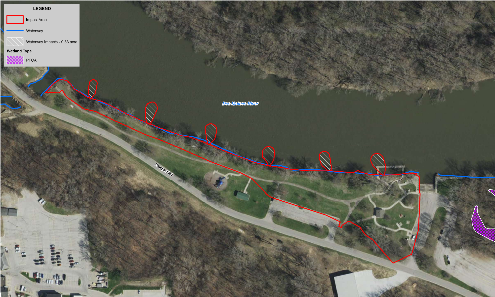
PROSPECT PARK - PRELIMINARY WOUS IMPACTS DES MOINES RIVER ACTIVATION AND POSSIBLE DAM MODIFICATION